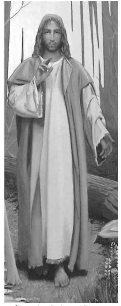
Chapel painting at Pacem

We yearn for these moments but how often do they occur? What does this passage teach us?