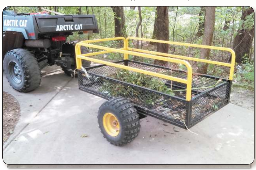
Thanks to a generous benefactor our grounds crew has this trailer to use!