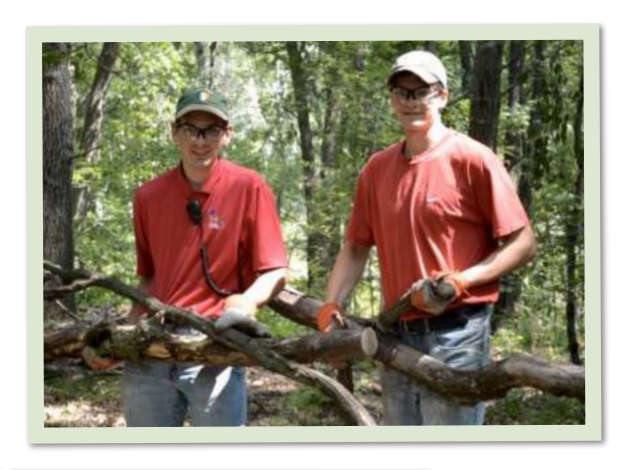
Clearing Pacem's Woods...Volunteers helped clear Pacem's wood and trails for all our Hermits!