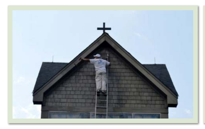
Refreshing Stain For Our Lady of Pacem and Hermitages