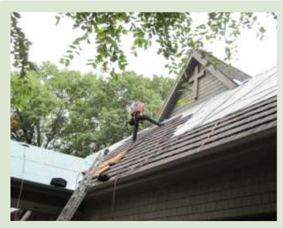
New Roof for Pacem