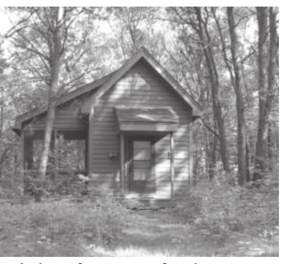
A place of peace—a refuge in a storm.

The good news is that the Lord is with us in the storm—just like with the apostles in the boat.