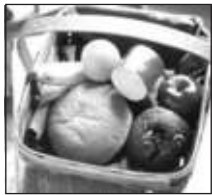
Simple but tasty hermit fare: homemade bread, fruit, cheese, and our special date-nut muffin.