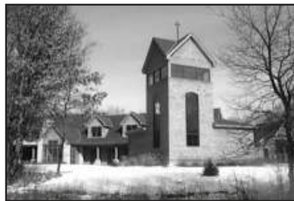
Our Lady of Pacem community house opened in 2000 to great rejoicing!

“Come unto me, all you who are tired and weary, and I will give you rest.”