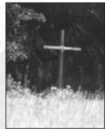
In 1982 we placed a cross on the prairie and dedicated the land to God.