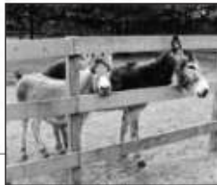
Our eight baby burro, Shiloh, was born in 2006.