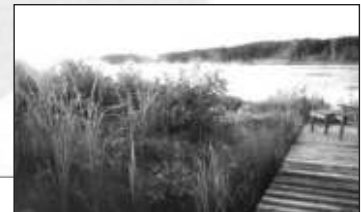
The boardwalk was completed in 1989 and is a favorite destination.