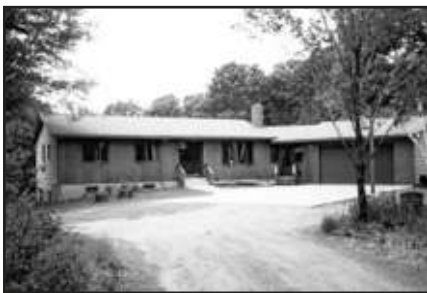
St. Joseph House, our first home, was purchased through an auction in 1987.

Like everyone who arrives home tired and weary from daily life, you need some time to let go, to symbolically “kick off your shoes” and enjoy that deep breath of freedom. We give you a simple, warm welcome and inquire into any special needs. This helps prepare you to enter the heart of the spiritual home, the hermitage. It’s the special “room” that’s prepared for your intimate time alone with God. There you find your true spiritual home, the home of the heart, where the Holy Spirit dwells. The Holy Spirit welcomes you, and in God’s great love, cares for you—body, soul, and spirit. ◆