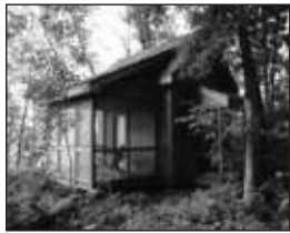
Pacem's hermitages are simple but elegant spaces, as befits an intimate meeting with God.