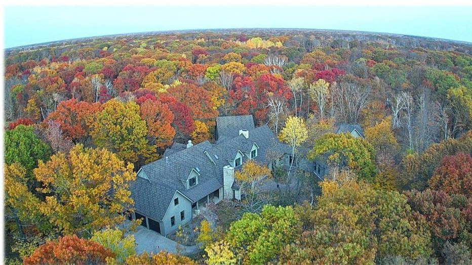
Fall at Pacem.

In the interests of cost savings, and to reduce the mail that you receive, Pacem has enclosed a special donation envelope with this newsletter.