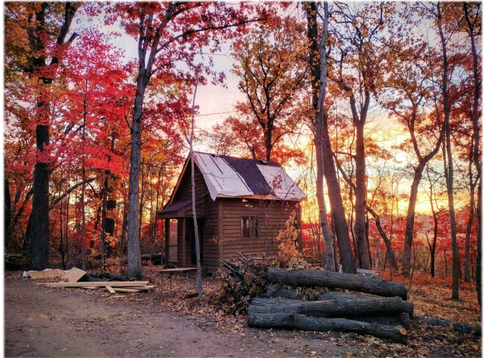
St. Therese of Lisieux hermitage undergoes repairs after sustaining damage from August 26th's straight-line wind storm.

Tree cutting and debris removal in October included the homes south of Lake Tamarack. Further clean-up and tree removal will take place throughout the winter months. Please continue to pray for Pacem during the restoration process.