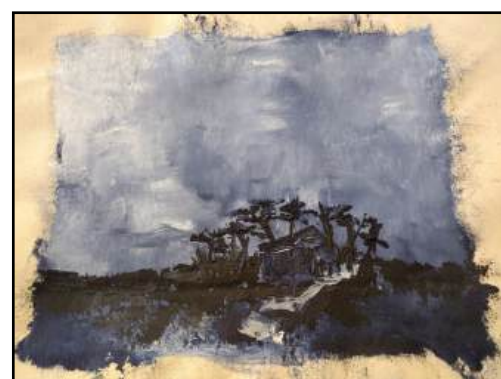
Hermitage at Night by Fernanda Sequeiros.