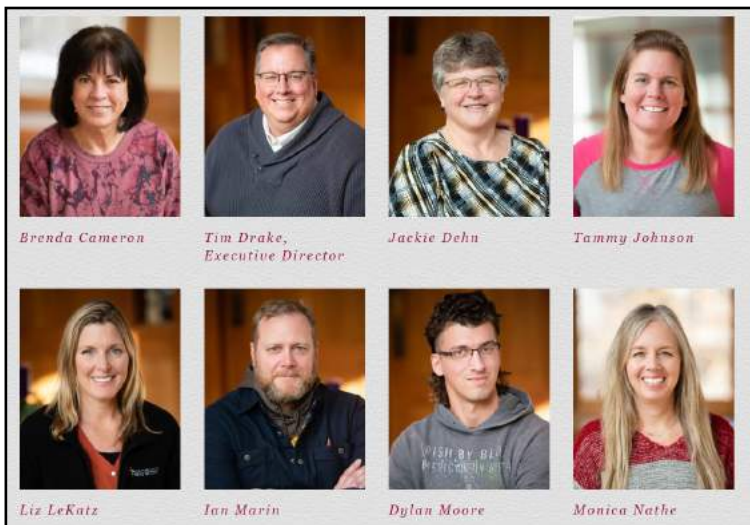
A portion of the staff page now available on Pacem's website.