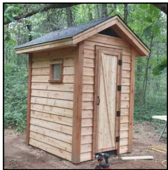
This new spiffy biffy will serve the 3 new hermitages.

W e are praying that ground can be broken soon for the three new hermitages. Hermit counts have continued to be high, so demand is pressing for the new hermitages. Two factors out of our control have prevented construction from beginning: labor and material shortages; and waiting for the construction permit from the county.