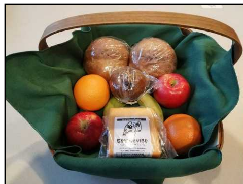
Pacem continues to provide a hearty food basket to guests.

As Pacem moves forward we will be discerning and praying how best to serve hermit guests in keeping with Pacem's overall mission, which is to "provide an environment where God's people come to be alone with Him." Meanwhile, Pacem will continue to provide its hearty food basket to each of our guests.