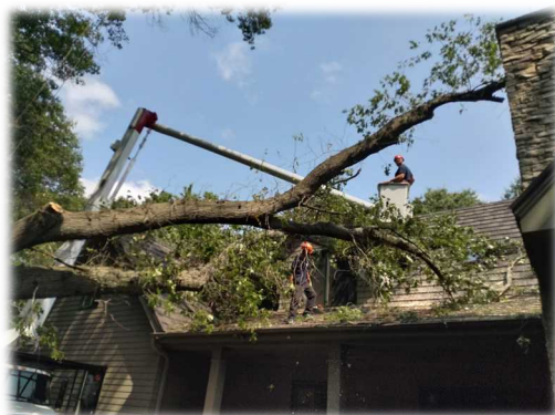
A work crew removes the oak from the roof of Our Lady of Pacem, July 18, 2021.

On July 18, half of a massive oak fell on Our Lady of Pacem's main retreat building, damaging the steel shingles, a fireplace, siding, gutter, and shattering a window. The repair work should be completed by December. To prevent further damage, the other half of the oak was removed by a tree removal service. While most of the repair work was covered by Pacem's insurance policy, there was a $5,000 deductible, and Pacem paid for the removal of the other half of the tree. Please consider making a donation to offset these unexpected costs. Thank you, in advance, for your generosity. Your gifts make operating Pacem possible!