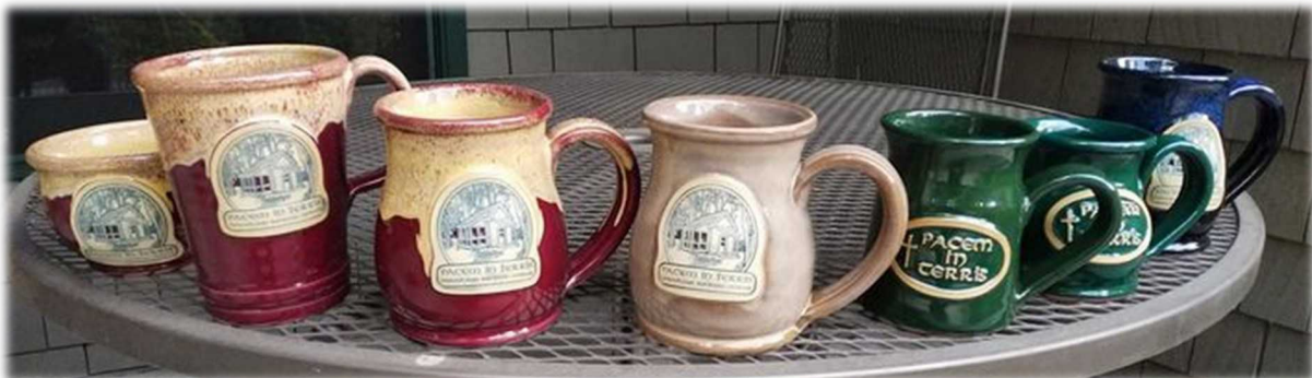
An assortment of Pacem mugs available for purchase as a keepsake of one’s time spent on retreat.