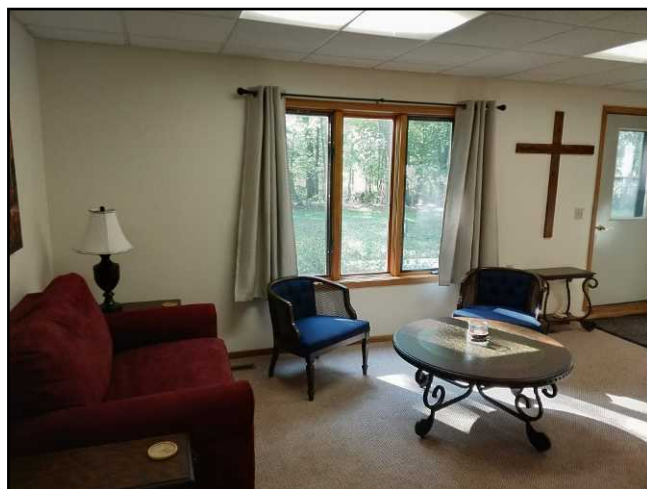
A view of the downstairs living room in St. Joseph House.

Guests have included pastors, priests, individuals, leadership of a women's book club, religious sisters, Church and school staffs. The house accommodates up to five individuals, has three bathrooms, a kitchen, dining area, living space, and a breezeway. We invite you to consider it as an option for your next day-long or overnight small group gathering.