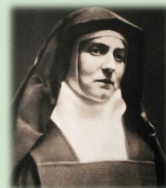
St. Teresa Benedicta

Stein wrote, "God is there in these moments of rest and can give us in a single instant exactly what we need. Then the rest of the day can take its course under the same effort and strain, perhaps, but in peace. And when night looks back and you see how fragmentary everything has been, and how much you planned that has gone undone, and all the reasons you have to be embarrassed and ashamed: just take everything exactly as it is, put it in God's hands and leave it to Him – really rest – and start the next day as a new life."