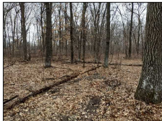
The new hermitages will occupy this vacant area.

It's been 21 years since the most recent hermitages were constructed. The new hermitages will be situated on vacant land near St. Francis Hermitage. Construction begins in June. While similar in design, they will utilize maintenance-free materials. Pacem is hopeful that the new hermitages will be ready to use for the busy fall season.