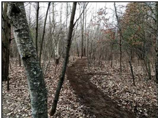
New trails run parallel with the roads at Pacem.