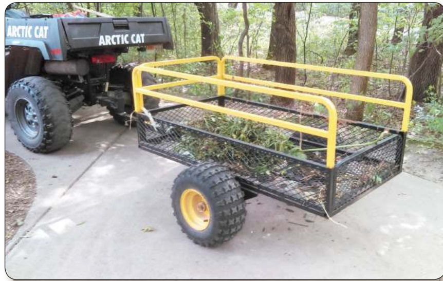
Thanks to a generous benefactor our grounds crew has this trailer to use!